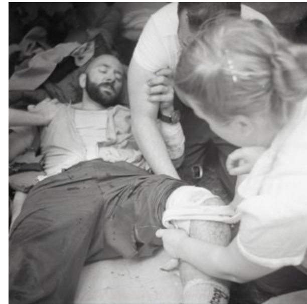
I ribelli della montagna.